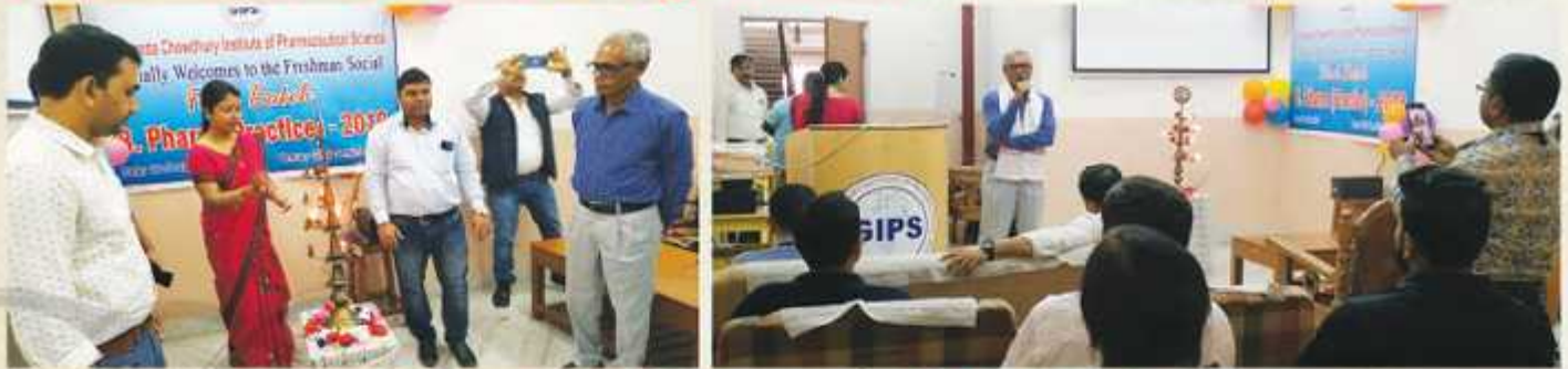
Freshman Social Programme for the First Batch of Newly opened Course B. Pharm (Practice) was organized on 17th September 2019