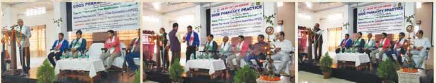
A one day CEP cum Seminar on Good Pharmacy Practice was organized on the eve of National Pharmacy Week on 24th November 2019. The seminar was organized by National Pharmacists' Convention Committee (NPCC) in association with Assam Pharmacy Council (APC) and Girijananda