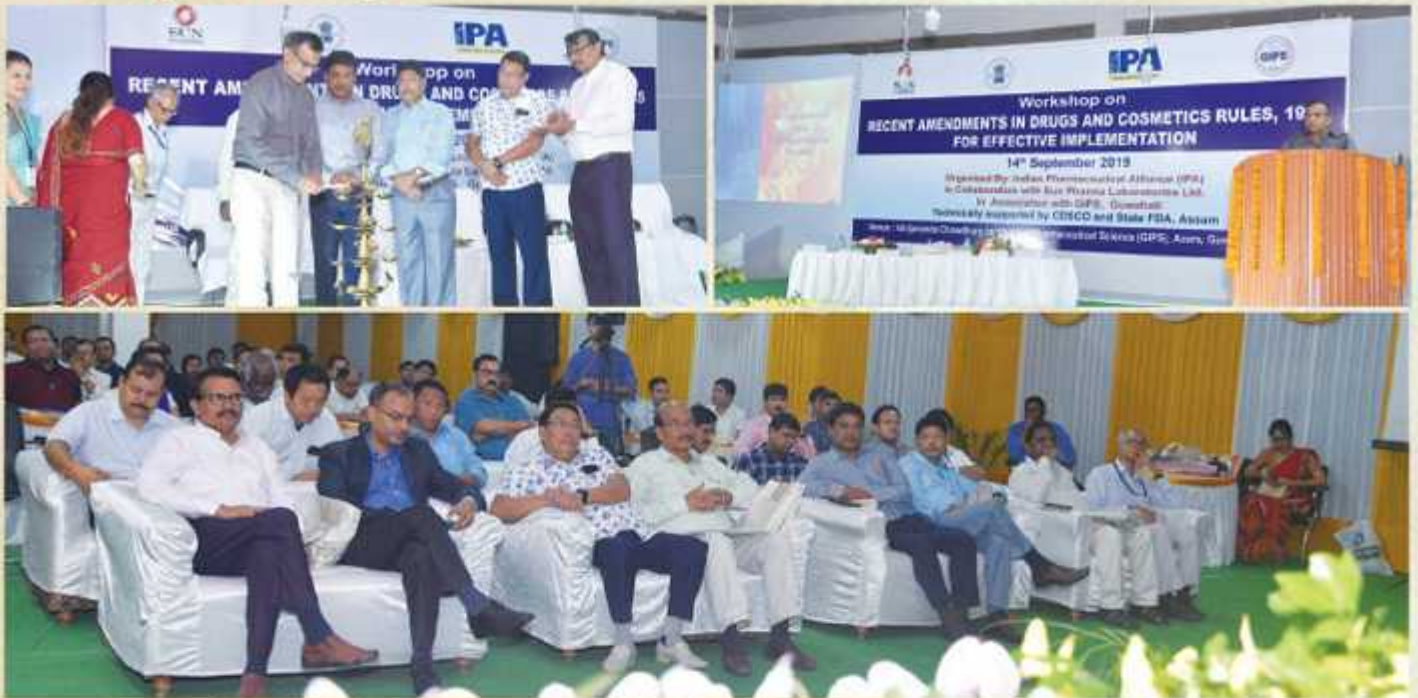
An one day workshop was organized by Indian Pharmaceutical Association (IPA) in collaboration with Sun Pharmaceutical Laboratories Ltd. And In association with Giriananda Chowdhury Institute of pharmaceutical Science on 14th Sept 2019