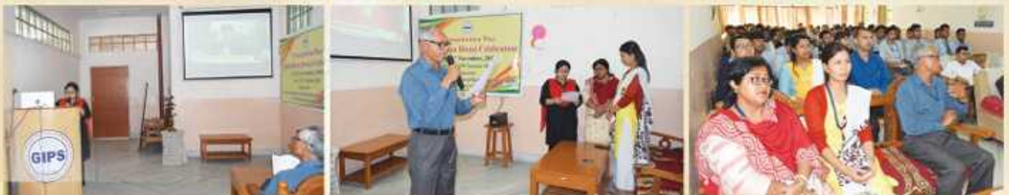
Constitution Day (Samvidhan Divas) was celebrated on 26th November 2019