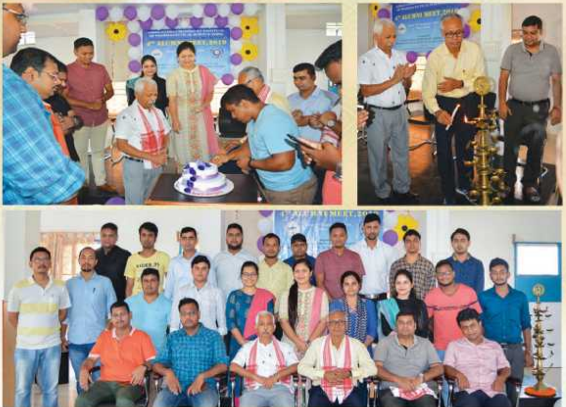
An one day workshop was organized by Indian Pharmaceutical Association (IPA) in collaboration with Sun Pharmaceutical Laboratories Ltd. And In association with Giriananda Chowdhury Institute of pharmaceutical Science on 14th Sept 2019